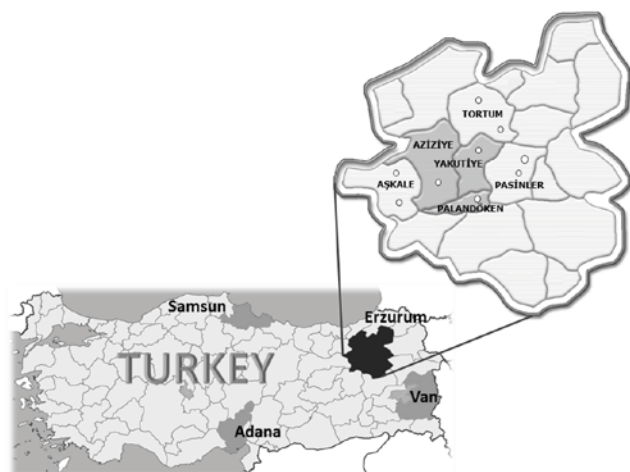
Figure 1. Locations of samples collected from the Province of Erzurum, and surroundings in Turkey.

Stool samples were obtained between 2016 and 2017 from small family farms in eight different centers, namely Erzurum center and Yakutiye, Palandöken, Aziziye, Aşkale, Tortum, Pasinler, and Hasankale (Figure 1). According to the rapid test kit results, stool samples that have none of the common enteric pathogens (rotavirus, coronavirus, Escherichia coli , Clostridium and Cryptosporidium ) were included in the study. Stool samples from a total of 72 calves with diarrhea were used in the study.